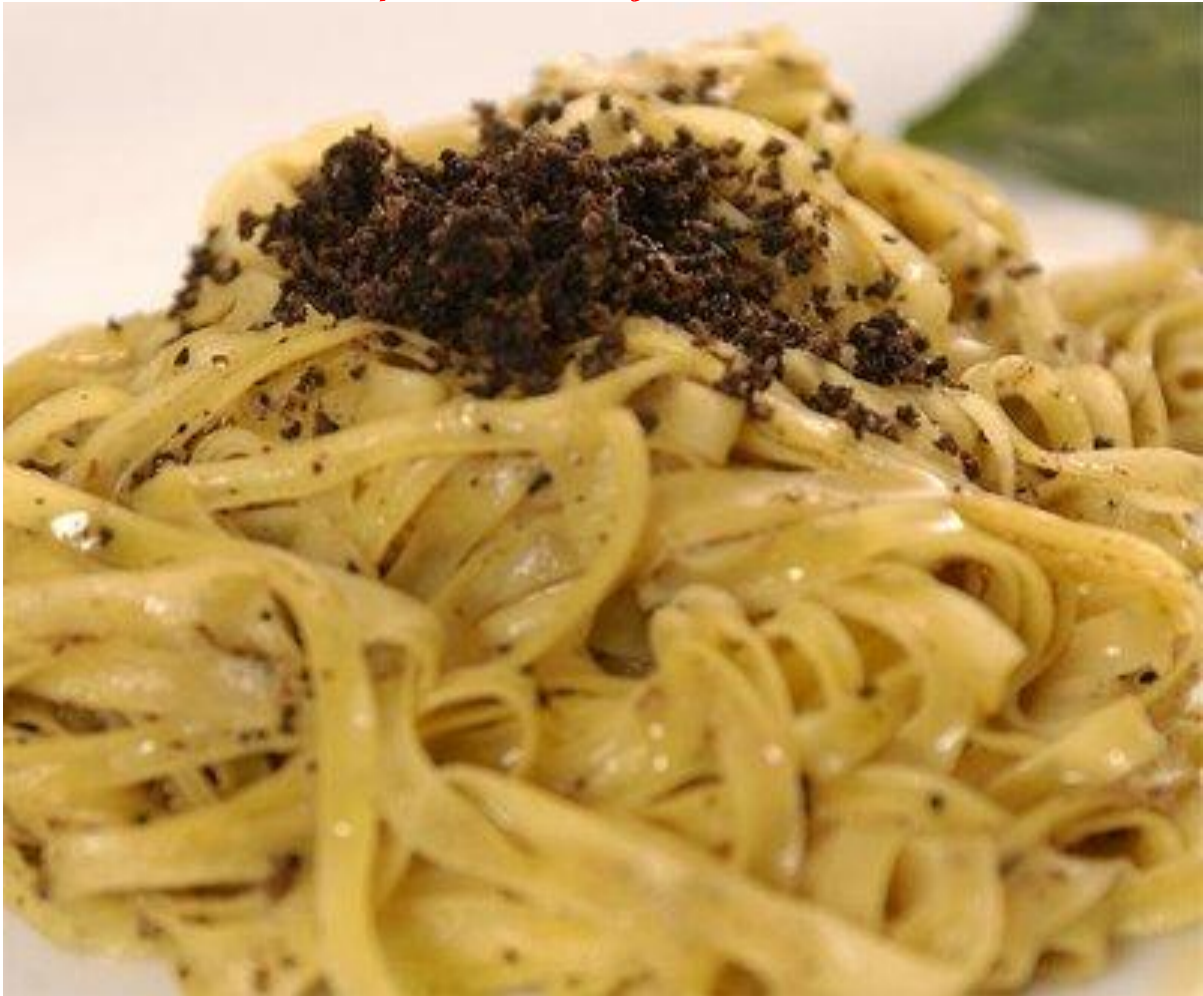
Tagliatelle al Tartufo Recipe