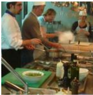
Love Umbria Tours