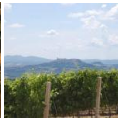
Beauty in Italy